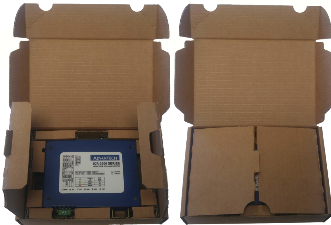
Figure 2: Packaging with the New Filling