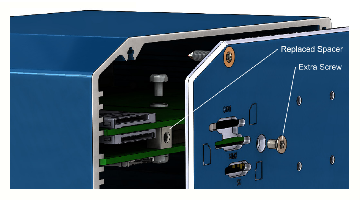
Figure 1: Assembly view – rear panel of the router (SmartFlex, SmartSwarm)