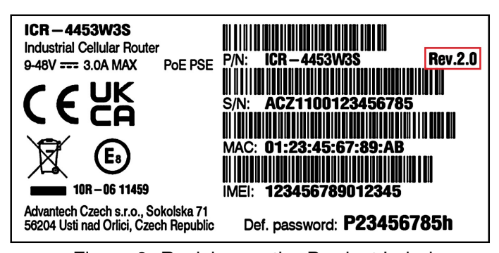
Figure 2: Revision on the Product Label