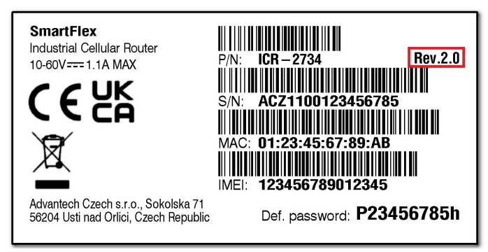
Figure 2: Revision on the Product Label