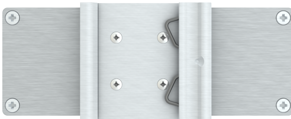
Figure 1: BB-SBD45 DIN Bracket on v2 Router

Detailed Description of the Impact: The replacement, BB-SBD45 DIN rail mounting bracket, is 5 mm higher than the original one. For this reason, the bracket exceeds the rear panel of the v2 router by 2.5 mm, see Figure 1.