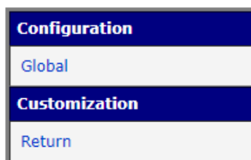
Figure 1: Main menu

Left part of this GUI contains menu with Configuration menu section. Customization menu section contains only the Return item, which switches back from the module's web page to the router's web configuration pages. The main menu of module's GUI is shown on Figure 1.