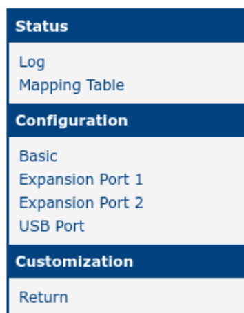
Figure 1: Menu

The GUI features a menu on the left side, which includes Status , Configuration , and Customization sections. The Status section provides Log and Mapping Table views, while the Configuration section includes options for basic Settings , Expansion Ports 1 and 2 , and USB Port . The Customization section contains a Return option to navigate back to the router's main web configuration pages. See Figure 1 for an illustration of the menu.