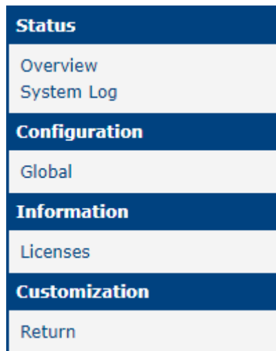
Figure 2: Menu

Left part of this GUI contains menu with Status, Configuration menu section and Information menu section. Customization menu section contains only the Return item, which switches back from the module's web page to the router's web configuration pages. The main menu of module's GUI is shown on Figure 1.