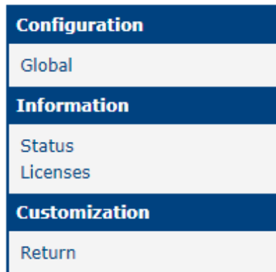
Figure 1: Menu

Left part of this GUI contains menu with Configuration menu section and Information menu section. Customization menu section contains only the Return item, which switches back from the module's web page to the router's web configuration pages. The main menu of module's GUI is shown on Figure 2.