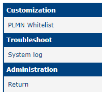
Figure 1: Menu

Left part of this GUI contains menu with Customization menu section, Troubleshoot menu section and Administration menu section. Administration menu section contains only the Return item, which switches back from the module's web page to the router's web configuration pages. The main menu of router app GUI is shown on Figure below.