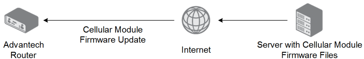
Figure 1: FOTA Router app Operation

The router app is easy to use – it can be activated with just one checkbox. The router must be connected to the Internet to use FOTA updates. The connection to the server with firmware files provided by Advantech Czech is already defined in the router app, but it is possible to enter your server credentials. The FOTA router app checks for the new cellular module firmware every 24 hours. It is also possible to check for new firmware manually.