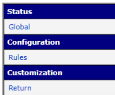
Figure 2: Main menu