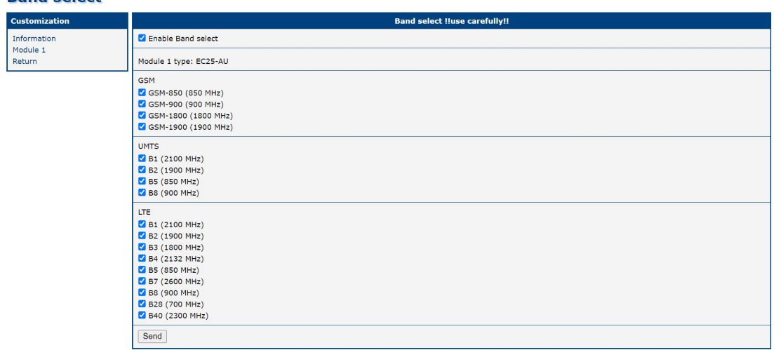
Figure 3: Configuration form for module EC25AU