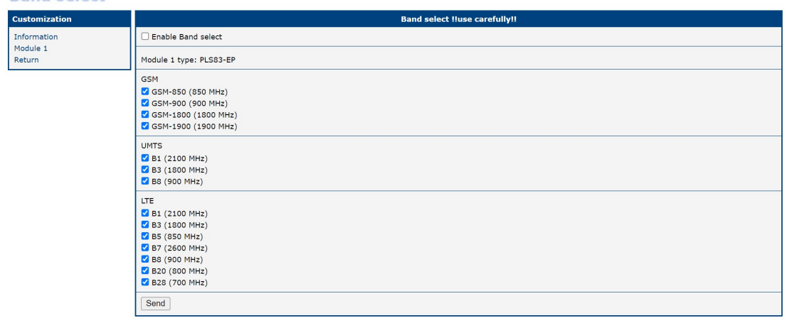
Figure 2: Configuration form for module PLS8-E